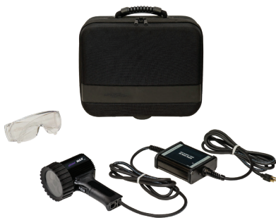
BASE MODEL In-line A/C Cord Model: UV-365MAXHC