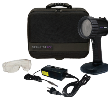
Z-MODEL External Battery Pack Model: UV-365MAXZHC