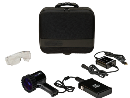
M-MODEL In-handle Battery Model: UV-365MAXMHC