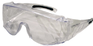
UVS-20 UV-absorbing Overglass Spectacles