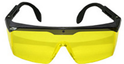
UVS-40 Fluorescence-enhancing Spectacles