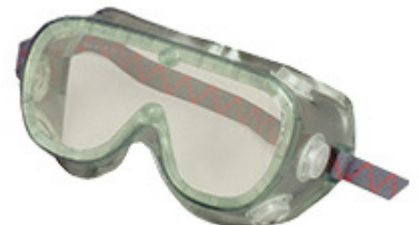
UVG-50 UV-absorbing Goggles