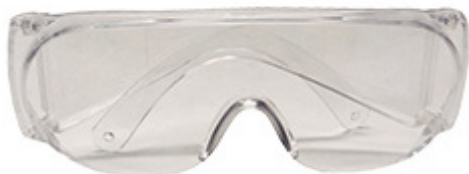
UVS-30 UV-absorbing Spectacles