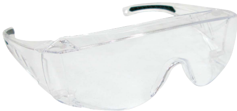
UVS-20 UV-absorbing Spectacles