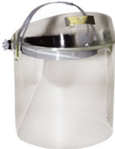
UVF-80 UV-absorbing Face shield