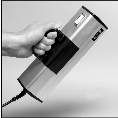
LAMP WITH CARRYING HANDLE