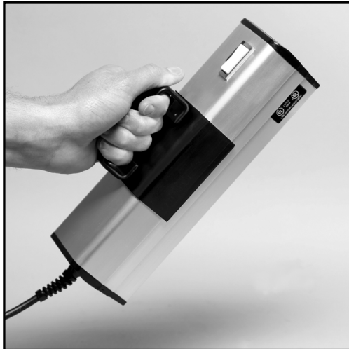
LAMP WITH CARRYING HANDLE