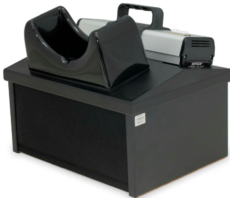
CM-26A UV VIEWING CABINET